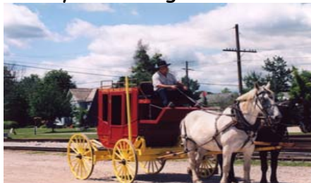
The Lonely Oak Stagecoach Line

Lasting approximately 10 minutes, experience travel behind real 'horse-power' as our for-fathers did, a fun time for everyone. Operating on Sep 25/26, 2010. Cost per person $3.00 (2 & up)