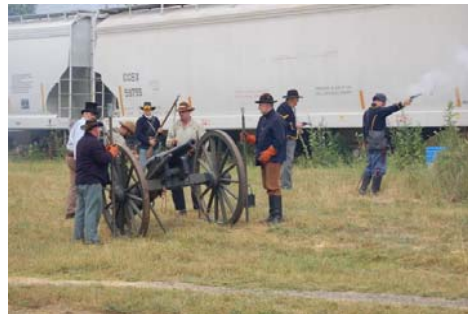
Field Cannon at the ready!