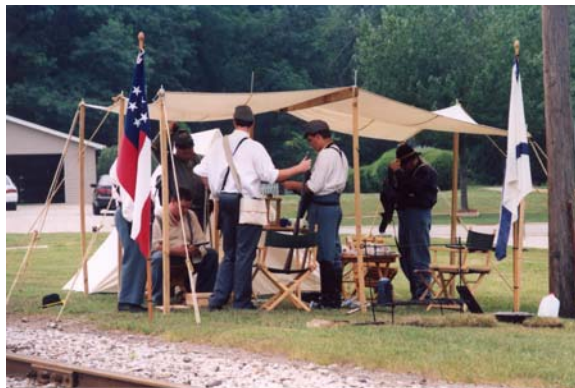
Encampment at Jefferson

Watch as the Union and Confederate soldiers battle for control of the railroad from the safety of your coach. Visit free our Civil War encampment with period merchants adjacent to the tracks at Jefferson.