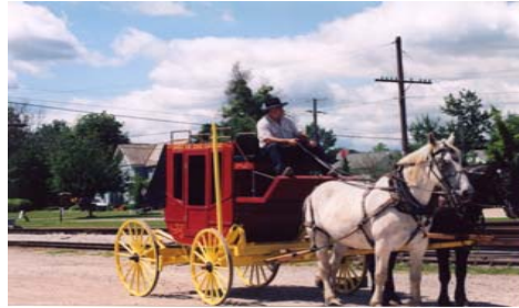
The Lonely Oak Stagecoach

The Lonely Oak Stagecoach will be providing round-the-block rides during this event. Lasting approximately 10 minutes, experience travel behind real 'horse-power' as our for-fathers did, a fun time for everyone.