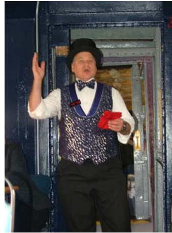
Watch closely now!

Internet ticket orders are accepted via our secure web site at www.familytrainrides.com